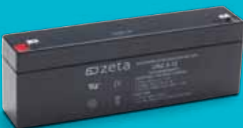
Maintenance-free long-life batteries

solisPOLE stores energy during the day for release after dark.