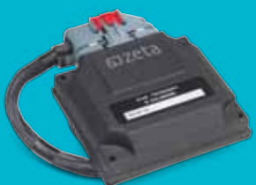
Award-winning intelligent controller